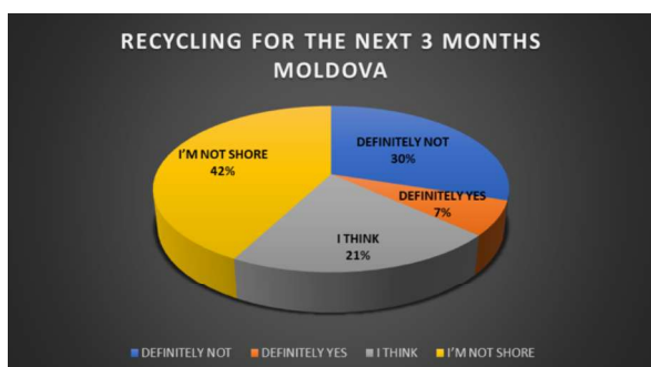
Fig. 4. Recycling for the next 3 months Moldova

Almost 20% are still thinking and over 40% are not sure.