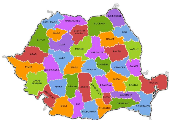
Fig. 1. Survey study area https://www.teolida.ro/lista-judete/

The area chosen for the study includes the entire territory of Romania, with respondents from 31 counties of the country as well as the Capital.