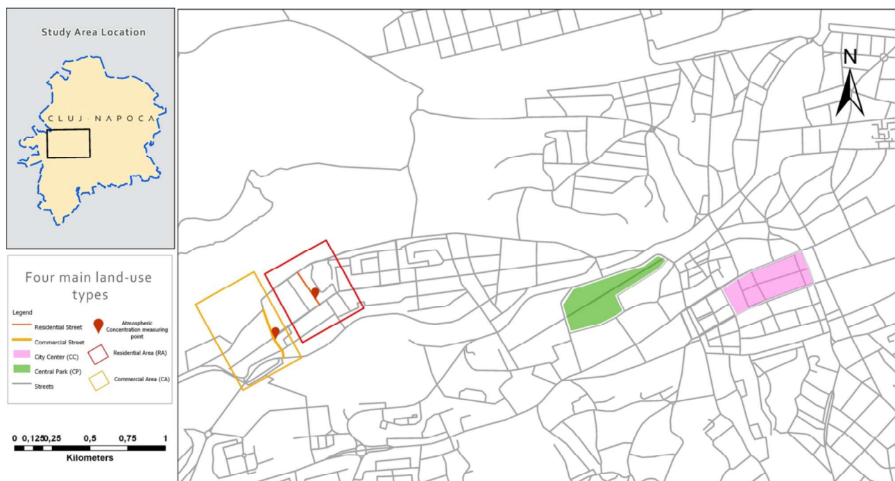
Figure 1. The location of the study area in the city of Cluj-Napoca, Romania and the four land-use types, and the location of the measuring points in the commercial and the residential areas as illustrated in the legend.

The selection of these four urban areas aimed to measure the difference of gas emission. The objectives of this study are to establish a better understanding of the correlation between land-use types and CH 4 concentration, to point out the importance for further investigation in the urban area in case of significant CH 4 concentrations and different variations, to reduce the degree of uncertainty regarding CH 4 emissions in the urban area and to give decision-makers indicators to potential CH 4 sources for applying appropriate mitigation measures.