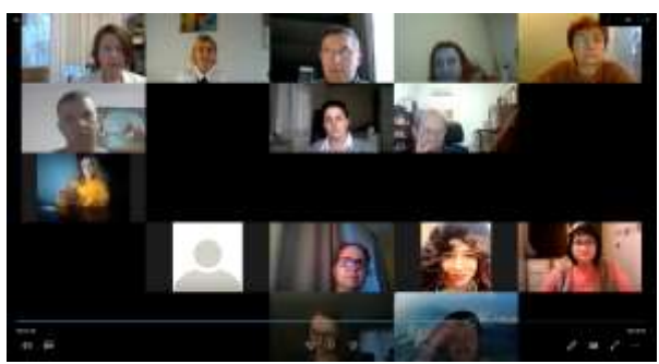
Fig. 2. Presentations held at The 18<sup>th</sup> Edition of the Student Scientific Session at Faculty of Food Engineering, Tourism and Environmental Protection, November 26<sup>rd</sup> -27<sup>th</sup> 2020, on-line.

Due to current social problems, such as COVID-19 pandemic, climate changes, we believe that the future scientific events will continue to be held in virtual and/or hybrid formats. We agree that there are differences between in-person interaction and digitallybased interaction, and for students' events (symposiums, conferences, workshops, etc.) is very important that the hybrid/on-line formats will be emphasized in the future. In this way the scientific events will have more participants and the international participation will begin/increase in the near future, which is the main goal of our Students Scientific Session from "Aurel Vlaicu" University of Arad, Romania.