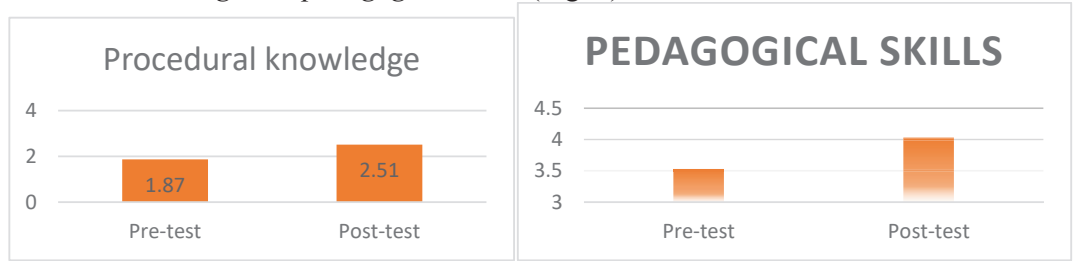
Fig. 2 The averages for active skills

In post-test, the averages for active skills shows a real progress of the surveyed indicators: procedural knowledge and pedagogical skills (Fig. 2):