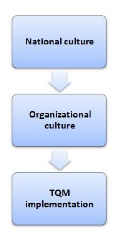
Figure no. 2: National culture and TQM

The national cultural dimensions that are appropriate for the TQM culture are low power distance, high collectivism and low uncertainty avoidance (Chin and Pun, 2002; Kumar and Sankaran, 2007; Largosen, 2002; Tata and Prasad, 1998; Saha and Hardie, 2005; Yen et al. , 2002).