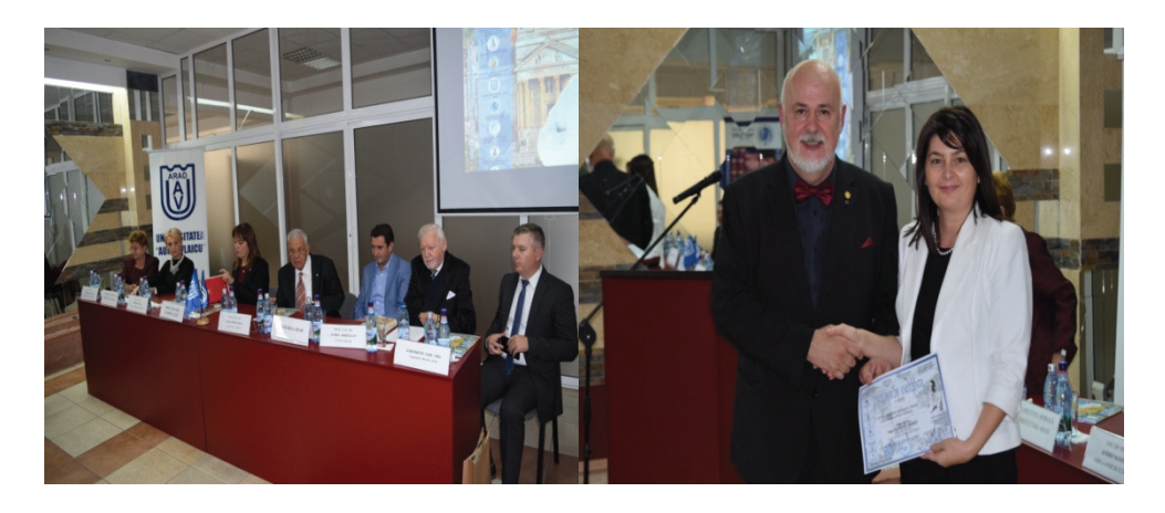
Figure 3. Presidium of the Symposium